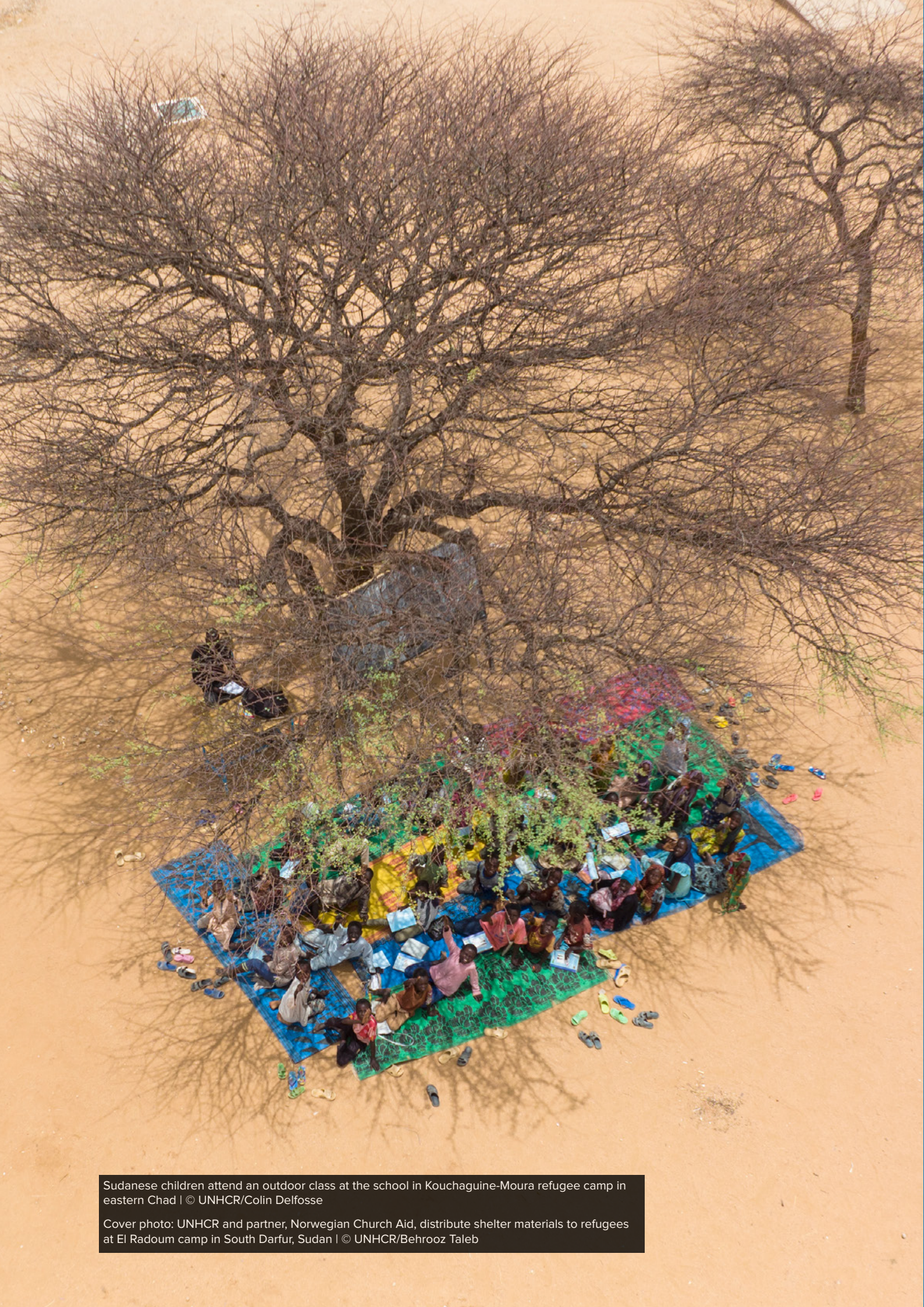
Sudanese children attend an outdoor class at the school in Kouchaguine-Moura refugee camp in eastern Chad