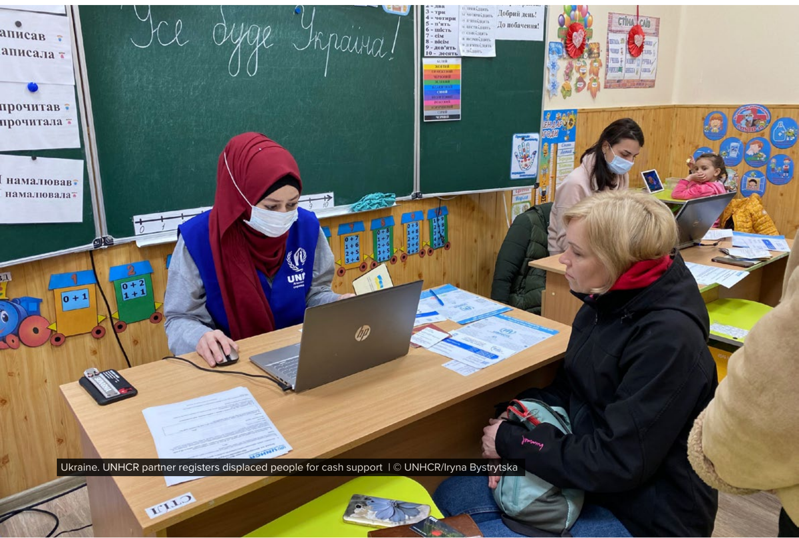
Ukraine. UNHCR partner registers displaced people for cash support

As of 24 October 2022, the international armed conflict in Ukraine has forced over 7.7 million refugees to flee abroad. Many have fled into Poland, while a large number have also sought safety in Bulgaria, Czechia, Hungary, the Republic of Moldova, Romania, Slovakia and other neighbouring countries. A significant proportion have also moved to other European countries. Refugee-hosting countries continue to demonstrate extraordinary solidarity, providing immediate assistance to people arriving, but the scale of the displacement is putting considerable pressure on available services and on hosting communities.