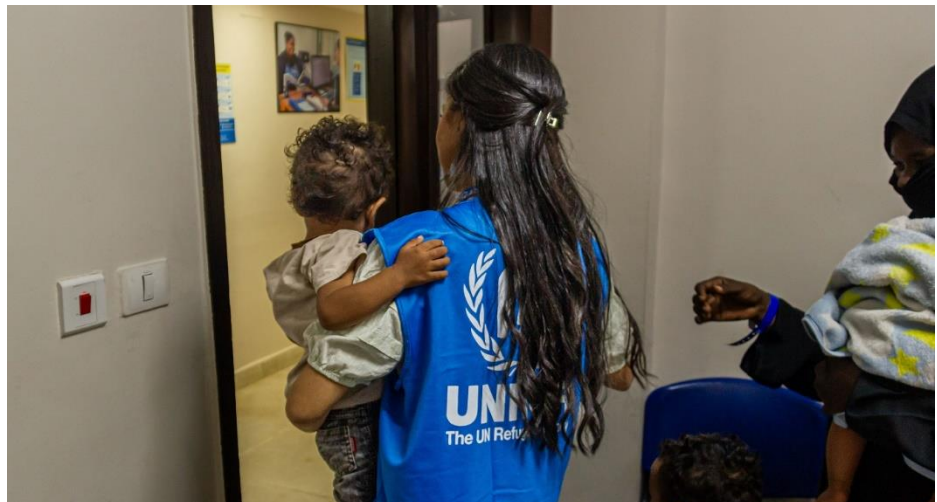
UNHCR Registration Assistant with a Sudanese child after completing a registration process in Cairo. The family, a single mother and three children, was forced to flee due to fighting in Khartoum, and found safety in Egypt.

UNHCR Egypt remains highly committed to preventing and responding to GBV and to providing comprehensive support to survivors, including new arrivals from Sudan. In July, UNHCR decided to expand the delivery of GBV safety and recovery packages, including cash assistance, to prioritize newly arrived female GBV survivors. UNHCR has since finalized the recommendation of more than 230 survivors for this type of assistance which is being processed. The safety and recovery package is designed to support GBV survivors and individuals at risk of GBV through provision of the financial assistance as part of a holistic case plan and individual needs assessments. With the additional funding available, a total of 600 individuals are expected to benefit from safety and recovery packages by the end of 2023.