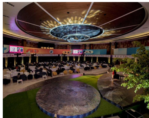
Kigali, Rwanda. 36 Million Solutions Private Sector Forum. 2021.

Collaboration between the PSP team in Africa and the EHAGL Regional Bureau was key to the success of this forum. In the lead-up to the event, regular consultations were held with senior management and programme colleagues for critical decision-making. PSP Africa and the Bureau worked together to mobilise the private sector community and to develop relationships with UNHCR. During the forum, the Regional Bureau Director engaged in bilateral meetings with the National Bank and Kush Bank to discuss partnership opportunities to support forcibly displaced communities in Kenya and South Sudan.