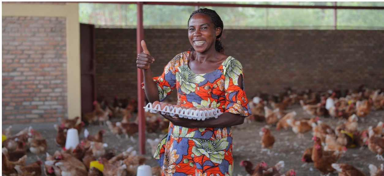
Rwanda. Refugees and host community members improve their livelihoods thanks to Misizi marshland project. 2021.

Retail in a Box: In South Sudan the WFP has rolled out a ‘ retail in a box ’ pop-up initiative in the Gorom refugee camp that is spurring on local businesses while helping refugees buy their foods of choice. As of mid-2023, Gorom was home to over 4,000 refugees across 11 villages. To create a new market for the refugee community, WFP installed portable storage containers in the camp, transforming them into secure shops with doors, windows, and ventilation. Local suppliers were selected and trained by WFP on food safety and quality, cash management and customer service. This initiative contributes to strengthening local market systems, making refugees and their hosting communities more resilient to shocks, and creating valuable income opportunities along agricultural value chains.