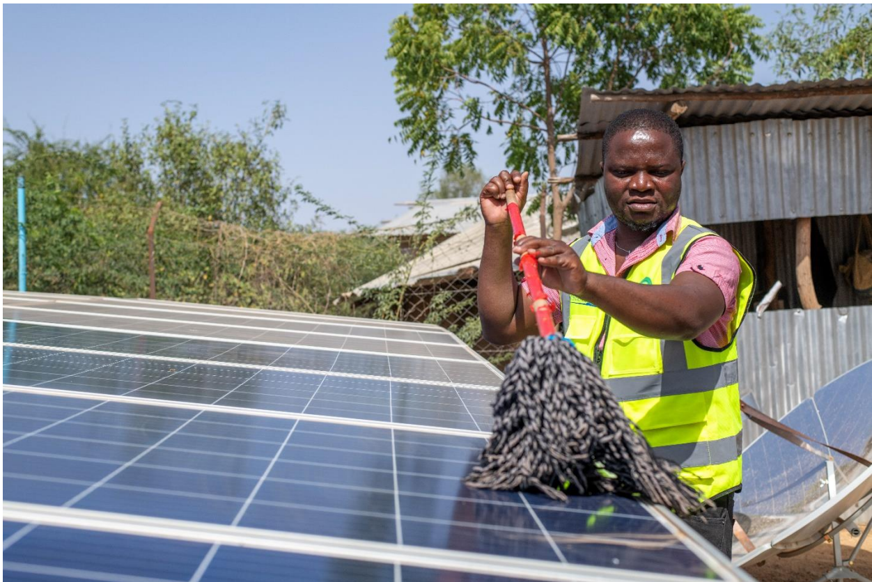
Kenya. Refugee-owned company supplies clean energy to camp residents. 2021.

The EHAGL region focuses on two key pillars of engagement, which will also be reflected in the upcoming global Private Sector Engagement Strategy, namely 1) a fund-raising component and 2) a focus on shared value partnerships. The latter is the focus of this briefing note.