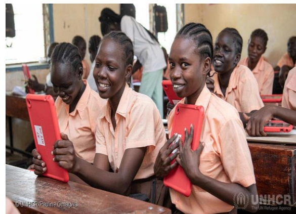
Kenya. Digital inclusion for gender equality. 2023.

Coursera aims to transform lives through learning. Coursera for Refugees brings this transformation to vulnerable populations around the world. Launched in 2016 when a handful of Coursera employees approached the U.S. Department of State with an idea: what if we could provide access to Coursera’s catalog at no cost to refugees around the world? Today, Coursera provides refugees worldwide access to wide-ranging courses. The platform serves over 118,000 refugees in more than 119 countries worldwide and works directly with governments and non-profits, enabling refugee learners to access top content from Coursera’s university and company partners for life-transforming skills.