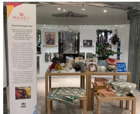
Uniqlo stores in Japan and England celebrated 2023 World Refugee Day with our artisan collection.

In collaboration with EAC, IGAD and the UNHCR EHAGL Regional Bureau, MADE51 is strengthening value chains for refugee artisans within the region and expanding regional sales networks. In 2022, MADE51 LSEs partners began to participate in joint regional marketing opportunities where they showcased and sold their refugee-made product lines at sales venues (i.e., Village Market) and events (i.e., Nairobi Marathon) in Nairobi. MADE51 products have been distributed through local, regional, and international markets. Internationally, MADE51 strengthens their ability to deliver on current opportunities (e.g., the 2023 UNIQLO order of 29,000 pieces). The EHAGL region has shown receptivity to this type of fair trade and mission-driven business. This regional programme will allow MADE51's model to grow into a larger business venture.