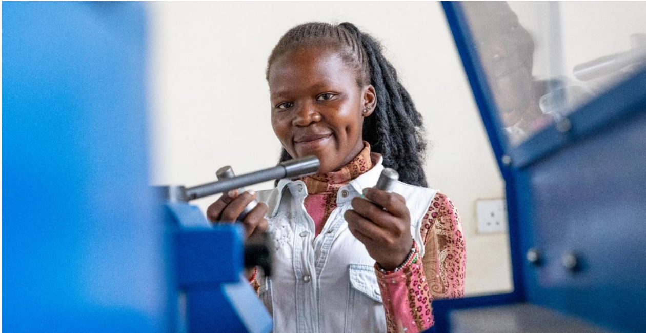
Kenya. UNHCR-World Bank Joint Data Center Kakuma mission. 2023.