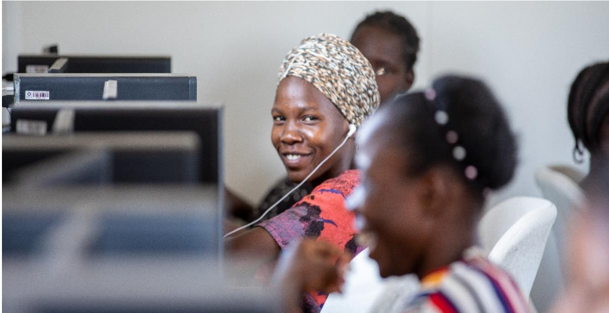
Kenya. Digital learning ICT for women. 2023.