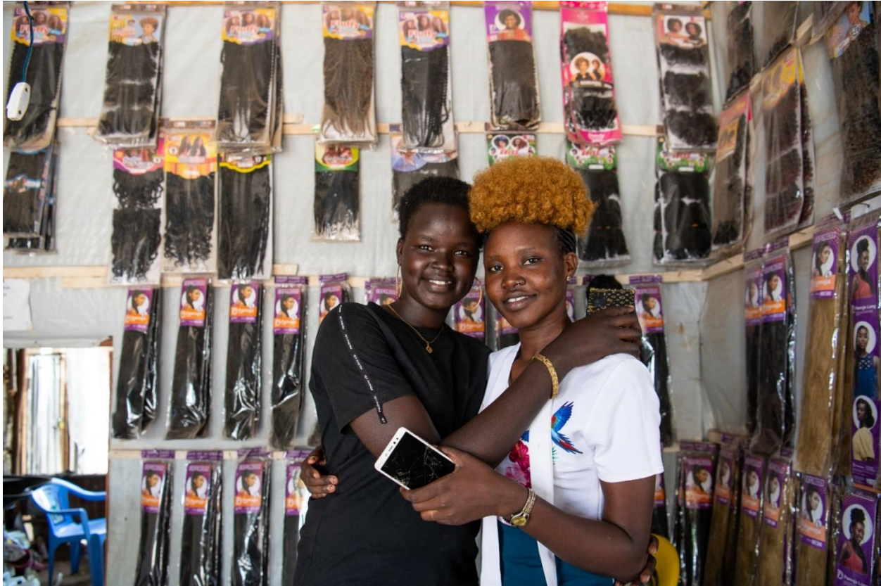
Kenya. Digital inclusion for gender equality. 2023.