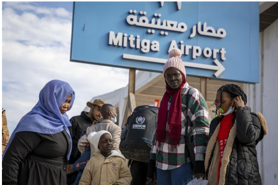
Asylum-seekers about to board UNHCR's final evacuation flight of 2023.

The Memorandum of Understanding between UNHCR, the Italian Ministry of Interior, and the Ministry of Foreign Affairs as well as local partners was signed on 20 December 2023 extending the humanitarian corridor/evacuations to Italy for 1,500 refugees and asylum-seekers during the next three years.