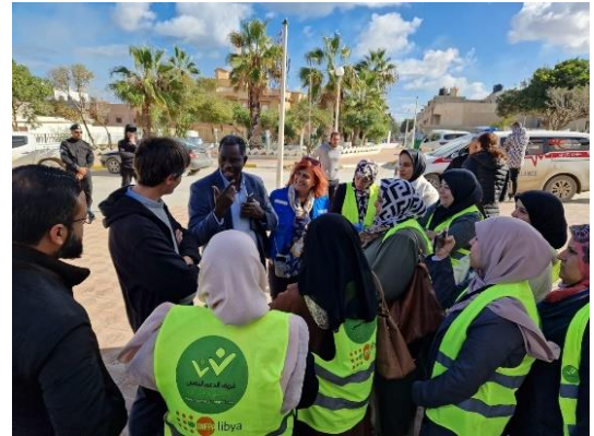
Interagency mission to the east of Libya.

When Storm Daniel struck eastern Libya in September 2023, UNHCR teams promptly initiated an emergency response. Working closely with national and international partners, including LibAid, UNHCR delivered life-saving assistance as part of a joint UN response. Over 40,000 people were reached with Core Relief Items and hygiene kits. In addition, UNHCR provided power generators and rubble halls, donated medical supplies, and handed over prefab containers and equipment to health authorities to set up psychosocial services. In mid-December, UNHCR participated in an inter-agency mission to the east of Libya alongside OCHA, IOM, UNICEF, UNFPA, WHO, UNDP, WFP, ACTED, and NRC. The agencies met with the local authorities to evaluate the coordinated humanitarian response and remaining needs following Storm Daniel.