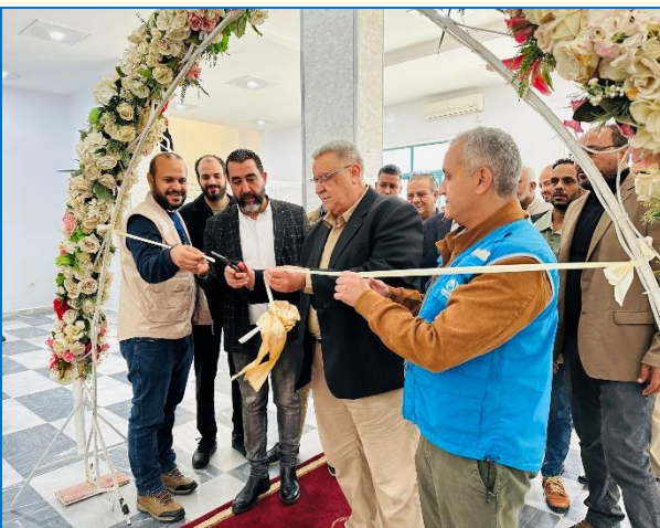
Handover ceremony of the Ras Obeida Clinic in Benghazi