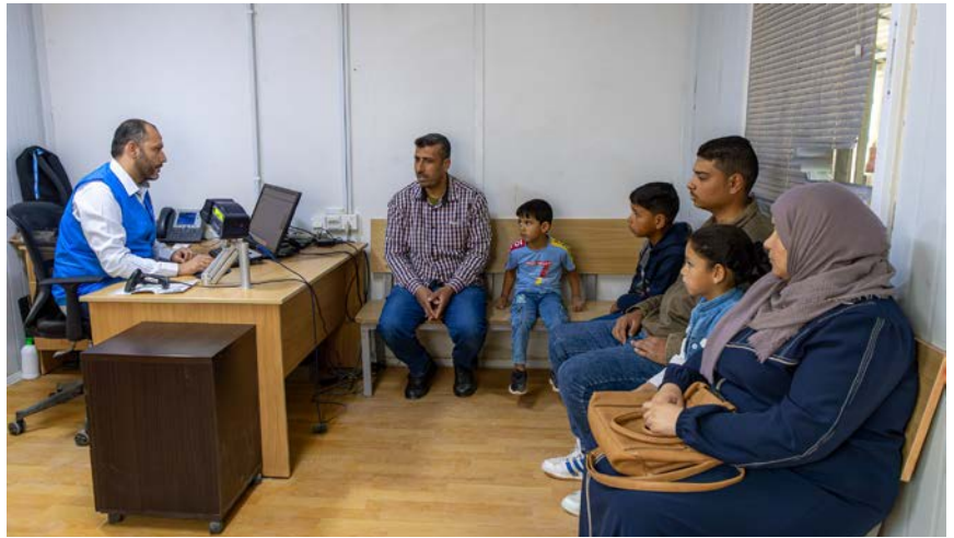
UNHCR interviews refugees to update their data, renew their documentation and guide them to counselling on different services if needed.

In Jordan, UNHCR registers refugees and issues legal documents that prevent statelessness, enabling refugees and asylum-seekers to access services and humanitarian assistance. These documents have a one-year validity, requiring refugees to visit UNHCR registration centres for renewals. In 2023, more than 471,000 refugees renewed their UNHCR-issued documents, and UNHCR also assisted Jordan's Civil Status Department in registering over 20,000 girls and boys at birth.