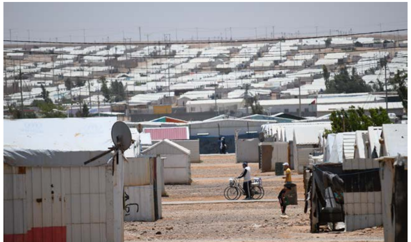
There are currently over 37,000 prefabricated transitional shelters in Azraq and Zaatari camps.

In its role as camp manager along with the government, UNHCR provides shelter to refugees living in Azraq and Zaatari camps and works to improve infrastructure. Almost all shelters in the camps have exceeded their life span and need maintenance or even replacement. However, due to funding constraints, UNHCR and its partners have only been able to repair and replace eight per cent of the containers. Since 2023, UNHCR and its partner have also been piloting a self-repair project to empower refugees, where families receive the needed materials, trainings, and cash to repair the shelters themselves.