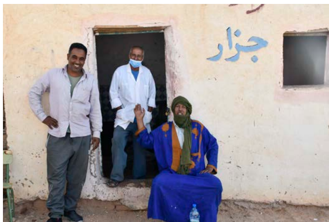
Three Sahrawi refugees share a moment of camaraderie outside a shop in Awserd refugee camp Tindouf, Algeria.