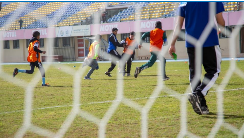
Children participating in the end-of-year Sport for Peace league.