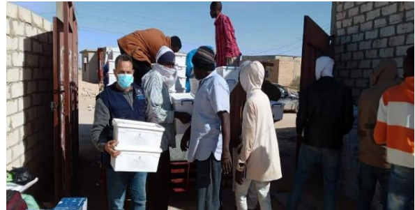
Distribution of core-relief items and hygiene kits to newly-arrived Sudanese refugees in Ajdabiya .

Since 15 April 2023, Sudanese asylum-seekers and refugees continue to arrive in Libya following the outbreak of conflict in Sudan. To date, UNHCR registered more than 13,000 Sudanese who arrived in Libya on or after 15 April 2023 in Tripoli, with more than 1,800 awaiting registration. On 16 January, UNHCR distributed core relief items and hygiene kits to a group of 39 Sudanese refugee households who arrived to Ajdabiya from Kufra. Further assessments of newly arrived Sudanese refugees in Ajdabiya are ongoing. Through partner LibAid, assessments of Sudanese refugees in Tobruk are also undertaken. On 22 January, UNHCR distributed blankets, male and female hygiene kits, solar lamps, kitchen sets, plastic sheets, and jerrycans to a group of 32 Sudanese asylum-seekers who recently arrived from Sudan to Ajdabiya through Kufra.