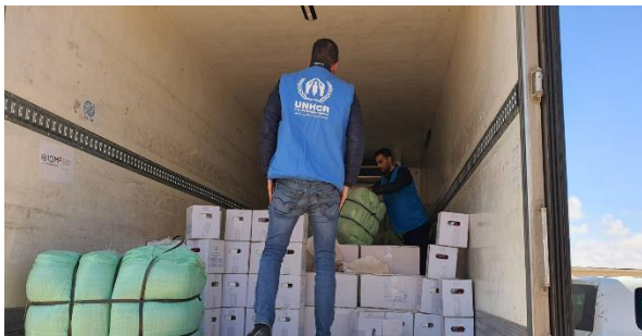
Distribution of assistance at Al-Assa facility.

On 22 February, UNHCR participated in an inter-agency mission to Al-Assa facility alongside IOM, UNICEF, and the Libyan Red Crescent. Al-Assa continues to be used as a transit point to hold people intercepted at the Libyan-Tunisian border area, before they are brought to detention centres in Tripoli or elsewhere. At the time of the visit, over 400 people were held in the facility. In cooperation with partner the International Rescue Committee (IRC), UNHCR distributed blankets, mattresses, clothes, hygiene kits, and food. Since June 2023, more than 7,800 migrants and persons in need of international protection have been intercepted at the border with Tunisia by Libyan authorities.