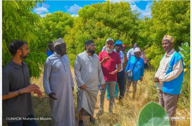
Muslim religious leaders & members from business community visit in Dadaab