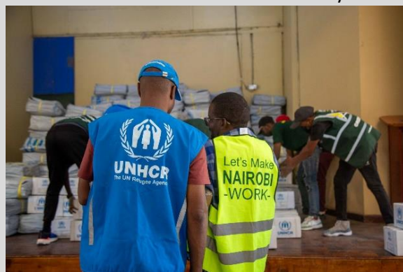
UNHCR Kenya, coordinates the delivery of non-food items with local authorities and partners. @UNHCR