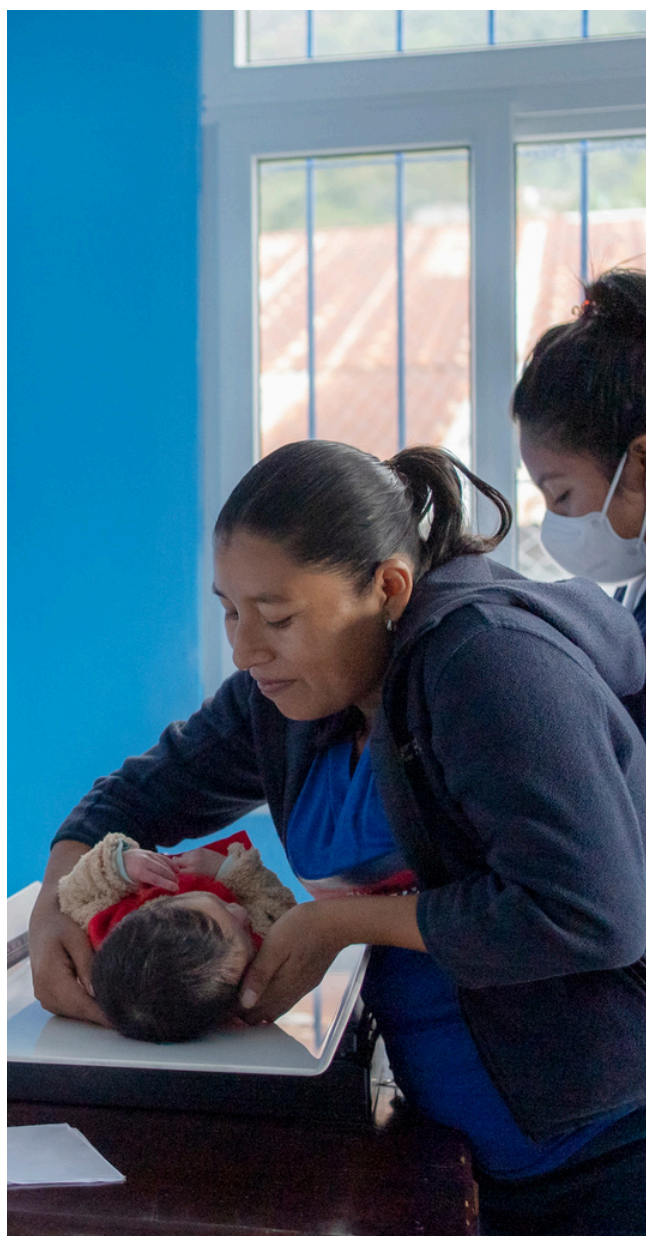
UNHCR supported the Chiquimula Health Area by reinforcing the health system with spaces to attend to the refugee and local population.