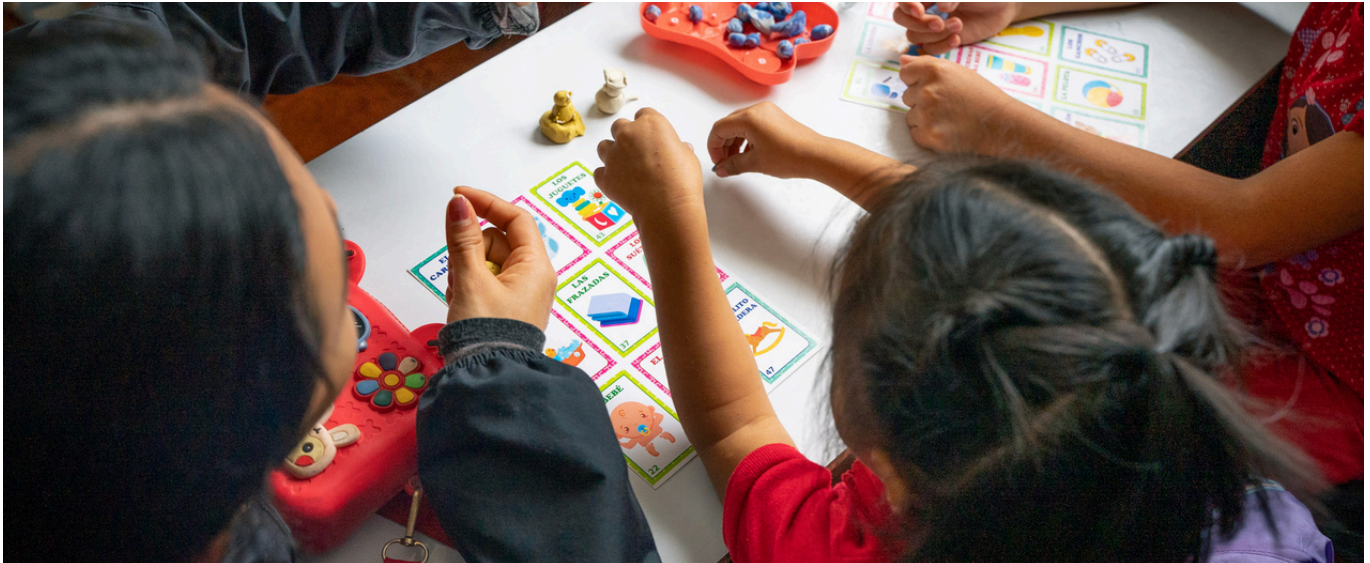
ACNUR, comprometido con el apoyo al derecho a acceder a la educación, apoya a organizaciones enfocadas a la niñez y juventud como Casa Joven en Amatitlán.