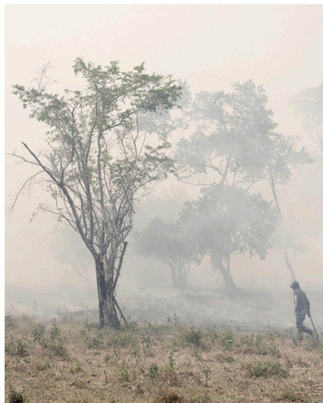
UNHCR supports local organisations such as Ak'tenamit on education and climate change issues