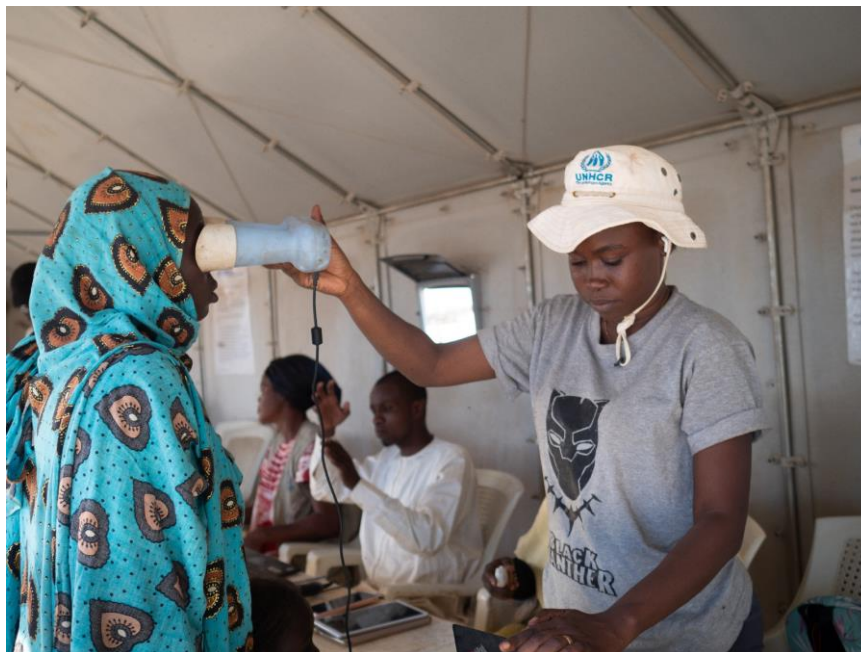
UNHCR and its government partners continue to register newly arrived refugees in Adré who have fled violence in Sudan, including through the collection of biometric data.

Including 214.8 million for UNHCR in 2024. The 2023 RRRP for Chad of 388 million was 41% funded with 160.8 million received.