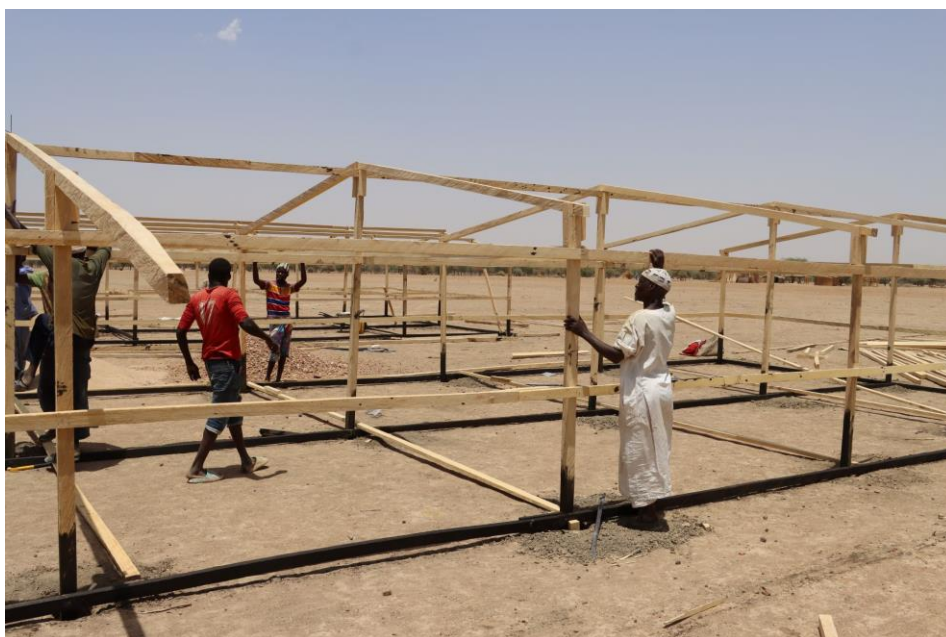
Construction of shelters on the Dougui site by refugees and Chadians.

Including 214.8 million for UNHCR in 2024. The 2023 RRRP for Chad of 388 million was 41% funded with 160.8 million received.