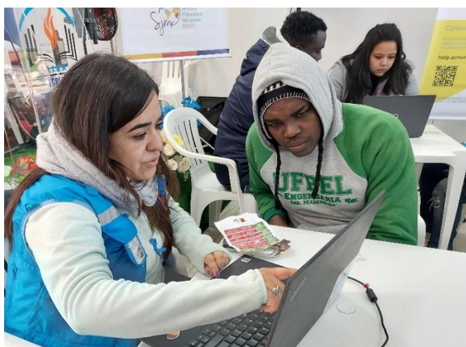
Haitian refugees affected by the floods receive counselling from UNHCR and its partner SJMR on protection, access to government social benefits and employment opportunities in Arroio do Meio, Vale do Taquari-RS.