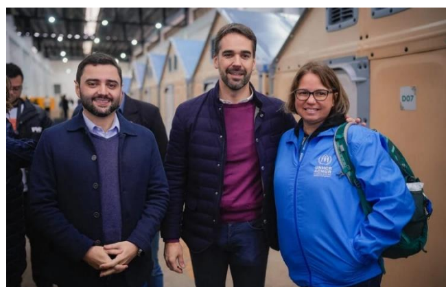
Rio Grande do Sul Governor, Eduardo Leite and Vice-Governor, Gabriel Souza have inaugurated the first of the 3 Humanitarian Centers for Sheltering and Assisting Displaced Families in the metropolitan area of Porto Alegre. The Center " Recomeço " is an initiative of the State of RS in collaboration with the Canoas Municipality and counted with the support of donations from private sector and UN Agencies, as well technical expertise on site planning and site management from UNHCR.

On 4 July, the first of the three Humanitarian Centers for sheltering and assisting displaced families by the floods (CHA) has been inaugurated by the Governor and Vice Governor of Rio Grande do Sul and the Mayor of Canoas. The center named " Recomeço " will accommodate 630 individuals (126 families), with a contingency capacity to shelter close to 1,000 individuals. UNHCR has provided technical assistance on site planning, shelter construction and site management to the Vice-Governor Cabinet of Special Projects, responsible for the construction of CHAs. UNHCR has also provided a total of 189 shelter units (RHUs) for the space. Distribution of non-food items (NFIs) is underway to the families arriving to the site, including blankets, jerry cans, hygiene kits and sleeping mats. UNHCR was able to contribute with the shelter units (RHUs) and CRIs thanks to the support of private donors such as LATAM and Gerdau, as well as the Armed Forces of Brazil (FAB and EB).