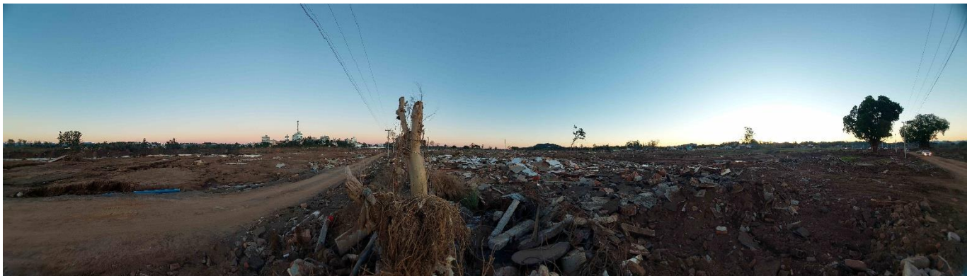
The scenery of total destruction: view of Passo da Estrela, a neighborhood in Cruzeiro do Sul (Vale do Taquari), where more than 600 houses were completely washed away by the floods, leaving behind a landscape of mud and rubble.

Source: UNHCR Protection Monitoring covering only refugees and people in need of international protection.