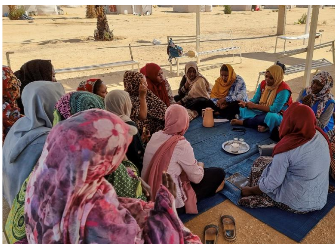
UNHCR protection staff conducting a focus group discussion with displaced women at gathering sites in Wadi Halfa