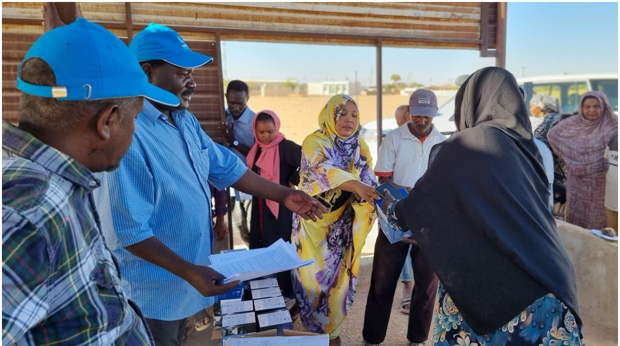
Internally displaced women in Red Sea State receive solar lamps.

UNHCR and partners provide formal and non-formal education for refugee children in camps, settlements and outside the camps. The schools follow the national curriculum and the Sudanese academic calendar. Before the conflict, the Government of Sudan had plans to gradually mainstream refugee education into the national system, but was put on hold as schools were when the conflict started. UNHCR still supports the payment of teachers' incentives in partnership with the MoE and is advocating with partners and Clusters to re-open schools across Sudan for children to resume their education, which has been interrupted for over a year.