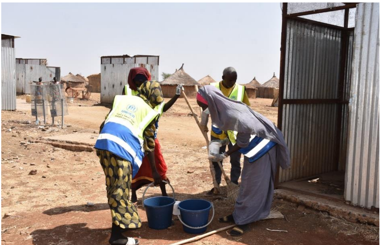
General cleaning, emptying wastebins and latrine disinfection using chlorine in White Nile State.

In Gedaref State 438 refugee households received emergency shelter kits which contain wooden poles, bamboo sticks, grass mats, locally produced ropes, and plastic sheets and another 14 shelters belonging to vulnerable refugee households in Babikri camp, Gedaref State were rehabilitated. In Blue Nile State, 37 refugee households received tents.