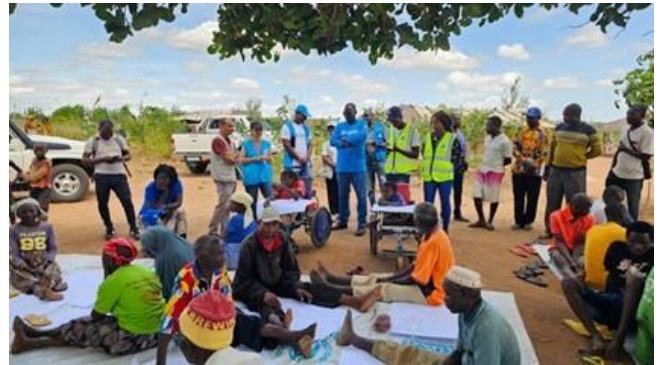
UNHCR teams conduct protection activities with the community in Chiure, Mozambique.

Context: As of May 2024, southern Africa was home to 9.1 million forcibly displaced people and returnees . The region comprises one of the largest IDP situations in sub-Saharan Africa, while refugee camps and settlements in multiple countries, along with some urban areas, host long-term refugee populations – some displaced for many decades. Complex crises cause millions to flee their homes and prevent their safe return every year. The situation is further complicated by the growing impact of climate change and natural disasters , which have displaced 1.1 million people in southern Africa.