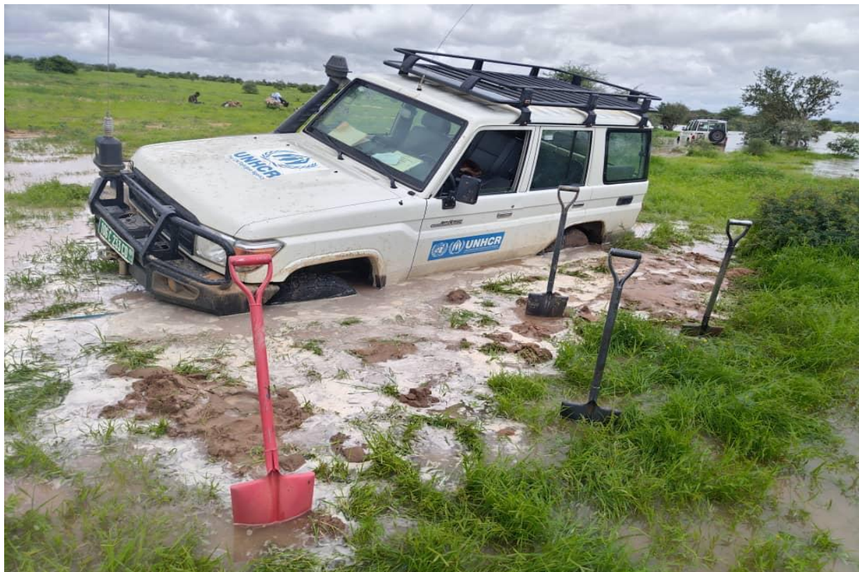
A UNHCR vehicle stuck in the heavy mud after returning from a border monitoring mission at the Tine border entry point in eastern Chad.