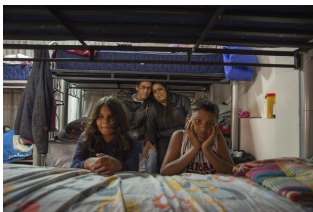
Refugee family in transit in Bolivia hosted in a temporary shelter in La Paz