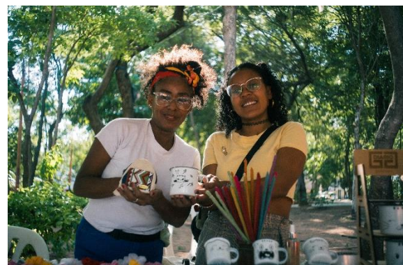
Venezuelans entrepreneurs in Paraguay, beneficiaries of seed capital during the World Refugee Day fair