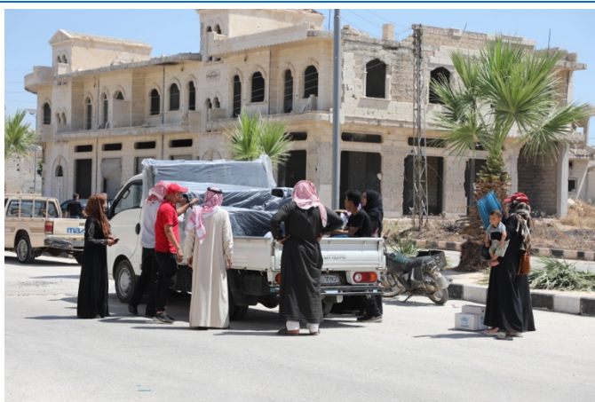
A family who recently returned to Abu Dali village in Idlib Governorate receive core relief items distributed by a UNHCR partner.