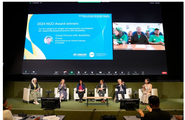
A representative of the Takatof Shababe Association (far left) receives the 2024 UNHCR NGO Award in Geneva, in the presence of the UNHCR High Commissioner.