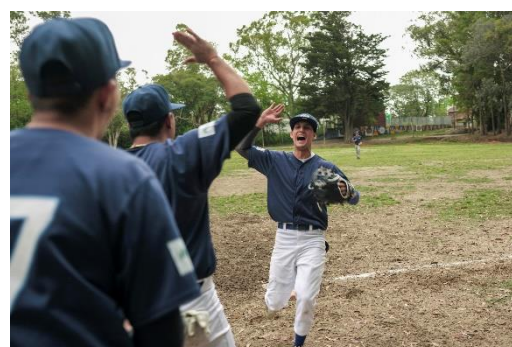
Refugee and migrants playing softball in Uruguay, bringing their home traditions to their new host country