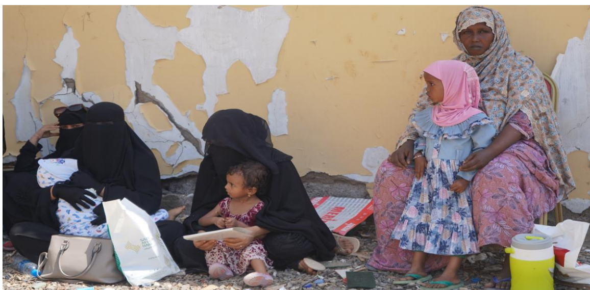
Refugee women with their children in Djibouti city waiting to receive assistance