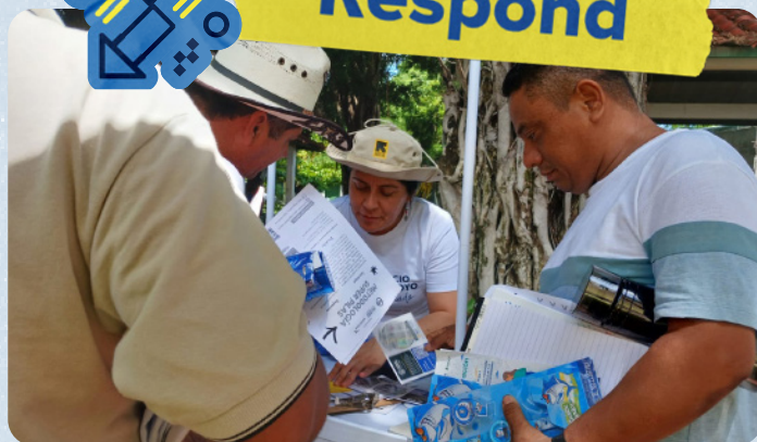
In Puerto El Triunfo (Usulután department) the mobile unit of UNHCR's Support Space "By Your Side" delivered information on rights and services.