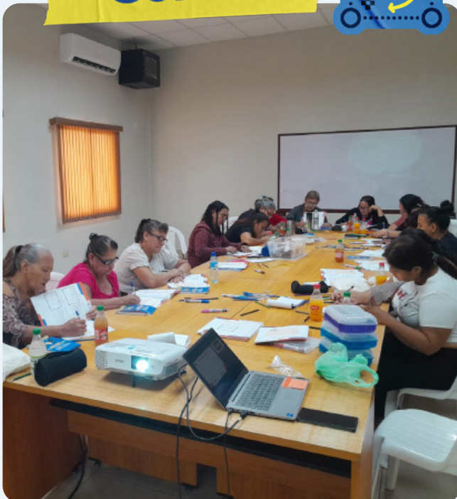
Participants of the Súper Pilas programme in Metapán, Santa Ana engage in sessions to develop life plans.

The fourth cohort in 2024 of Súper Pilas began with 165 participants, including 60 women referred by the national institution on women ISDEMU and funded by the MIRPS support platform. So far in 2024, UNHCR has provided capacity-building for self-employment and entrepreneurship for 261 people and aims to provide at least 100 participants with seed capital by year-end, supporting entrepreneurial projects that promote self-reliance.