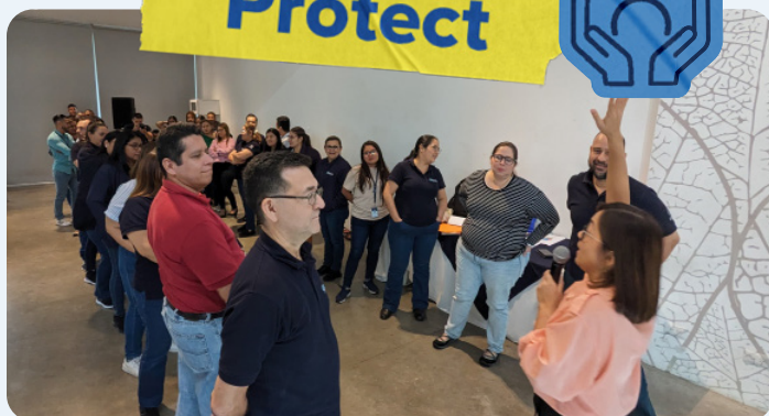
Staff members from GAMI engaging in group dynamics during a training on emotional intelligence.

Some 200 people in Puerto El Triunfo, Usulután department, received information on rights and services, as well as medical and psychosocial attention in a service fair "By Your Side" (Feria A Tu Lado) organized by UNHCR, IRC and the municipality. The Directorate for Attention of Victims, the Ministry of Labour and Social Welfare, the Attorney General's Office (PGR), partners Doctors of the World, ORMUSA, World Vision, and other organizations joined forces in the event.