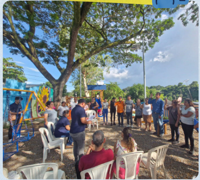
People in La Campanera community voting to elect their community board.