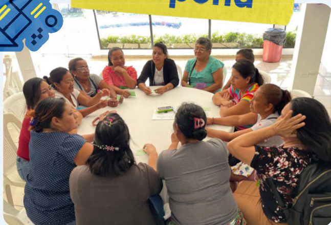
Women from various regions engage in a dialogue to share challenges and solutions for their communities.