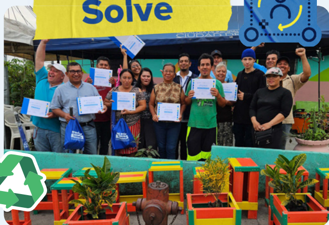
Residents of La Campanera community showcase the recycled fiberglass products they created through UNHCR-supported training.