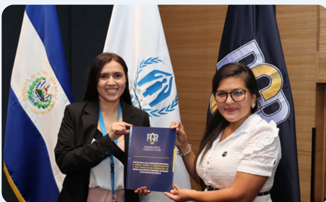
PGR staff during training sessions on the new protocol for the protection of displaced children developed with UNHCR support.