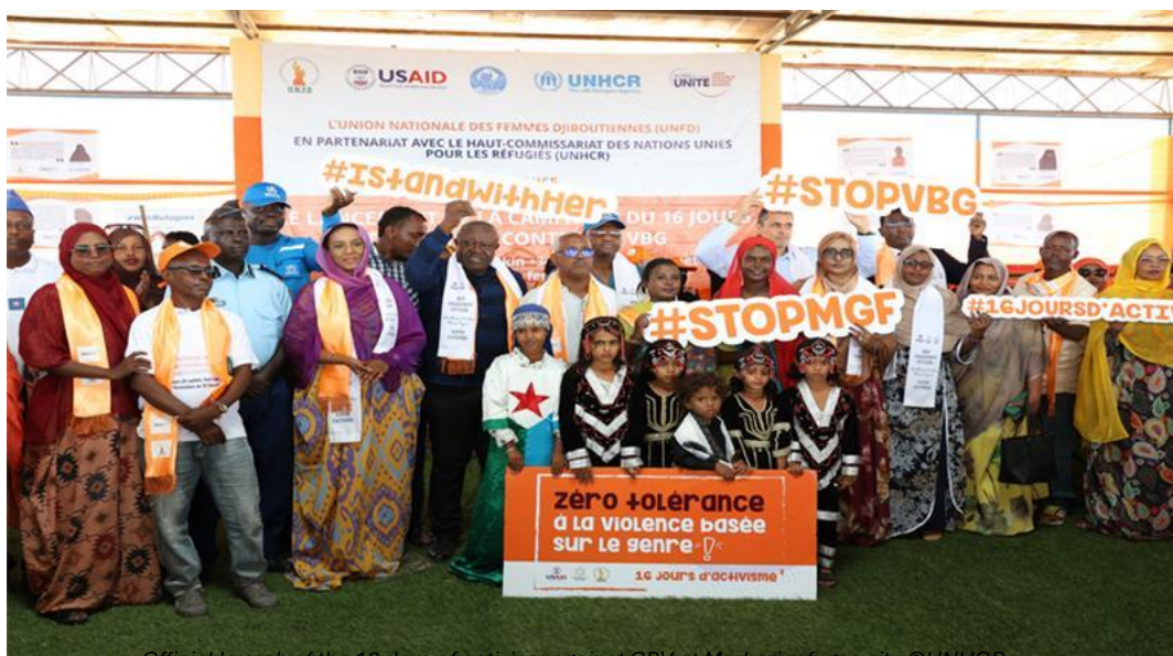
Official launch of the 16 days of activism against GBV at Markazi refugee site