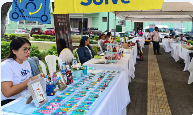
Entrepreneurs from the Súper Pilas livelihoods programme showcased their products at a fair in Santa Ana.