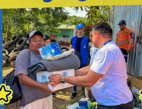
Communities affected by the seismic swarm in Conchagua, La Unión, received kits with essential supplies donated by UNHCR to Civil Protection.