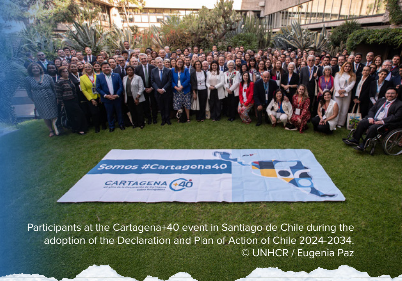
Participants at the Cartagena+40 event in Santiago de Chile during the adoption of the Declaration and Plan of Action of Chile 2024-2034.

In December, Latin American and Caribbean countries reaffirmed their commitment to solidarity, protection, and the search for comprehensive, inclusive, and sustainable solutions for refugees, displaced people, and stateless individuals in the region by adopting the Chile Declaration and Action Plan. These important documents marks the conclusion of the 40th anniversary celebrations of the 1984 Cartagena Declaration on Refugees, which remains one of the region's most relevant strategic frameworks for protection and solutions.