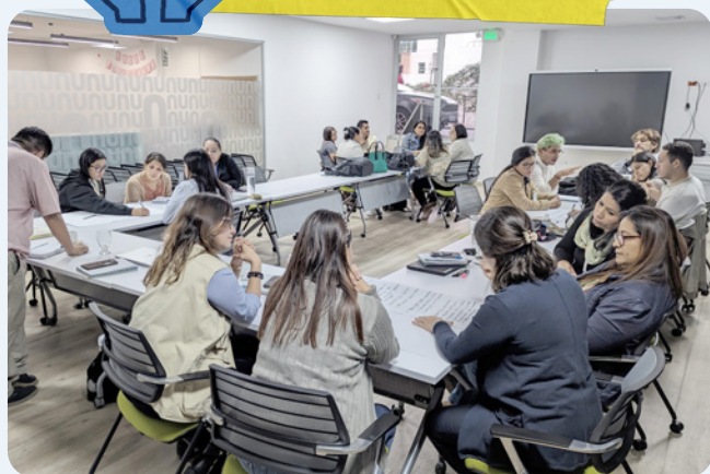
Delegates from NGOs and government institutions shared protection best practices in a workshop by UNHCR and UNICEF.