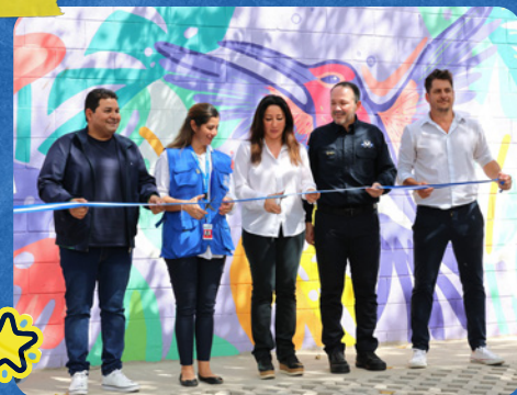
Under the "Revive tu Espacio" initiative, UNHCR along with government representatives inaugurated a park in La Campanera, Soyapango.