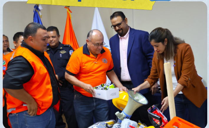
To enhance emergency preparedness and response, UNHCR donated tools to Civil Protection Commissions in San Miguel and Santa Ana.