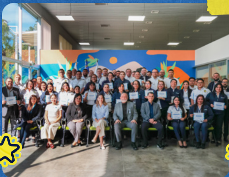
Migration officials at the closing ceremony of a three-month diploma on international protection.