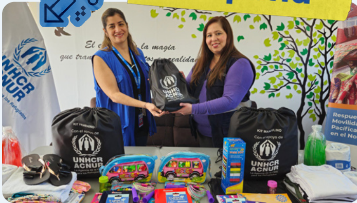
UNHCR donated pedagogical and hygiene kits to the returnee reception centre GAMI in San Salvador.