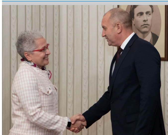
UNHCR's Representative met with Bulgarian President Rumen Radev

With the new school year, a significant increase of refugee students' school enrolment was. 70 teachers participated in the Academy for Refugee Teachers on inclusive education organized by UNHCR and the Ministry of Education and Science, 2,611 children received cash assistance and 830 children benefited from educational support activities.