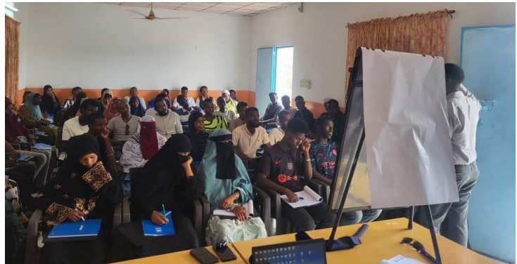
The National Agency for Employment, Training and Professional Integration (ANEFIP), in collaboration with ONARS and UNHCR, trains 150 young refugees in Ali-Addeh, Holl-Holl and Markazi