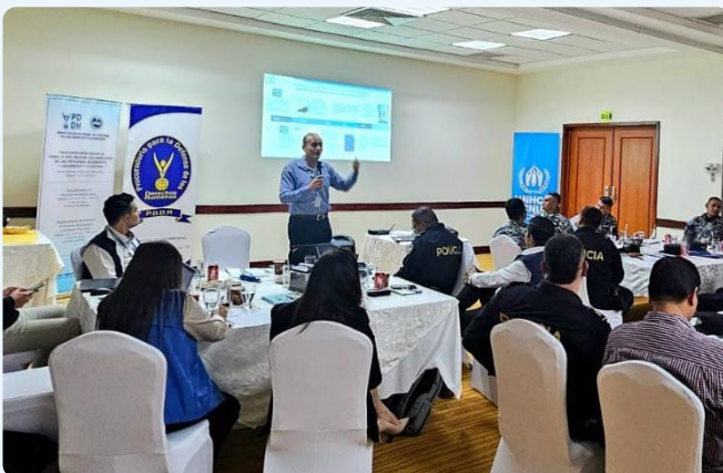
Staff from PDDH during a workshop on international protection for Police staff in La Unión.

The enhanced capacities will further the effective attention to individuals seeking international protection in El Salvador.