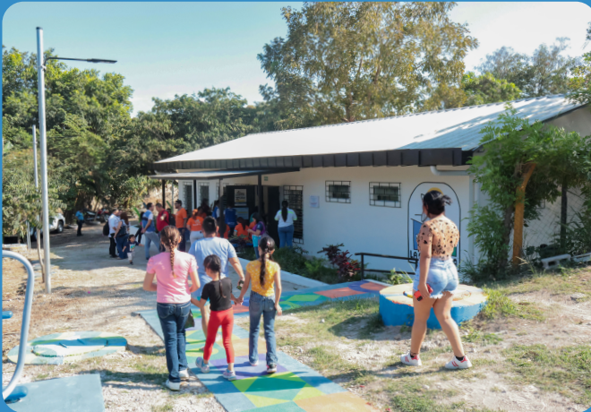
Neighbours gathered in La Campanera, Soyapango for the inauguration of their renovated communal house.