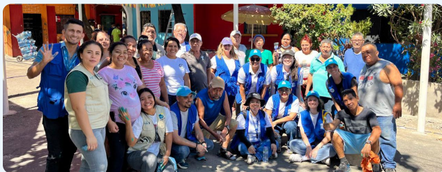
Residents of Tutunichapa came together to revitalize their community by painting the facades of their houses.