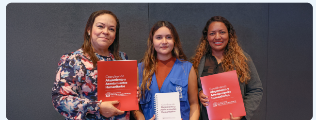
Representatives from La Campanera community joined the presentation of community mapping.