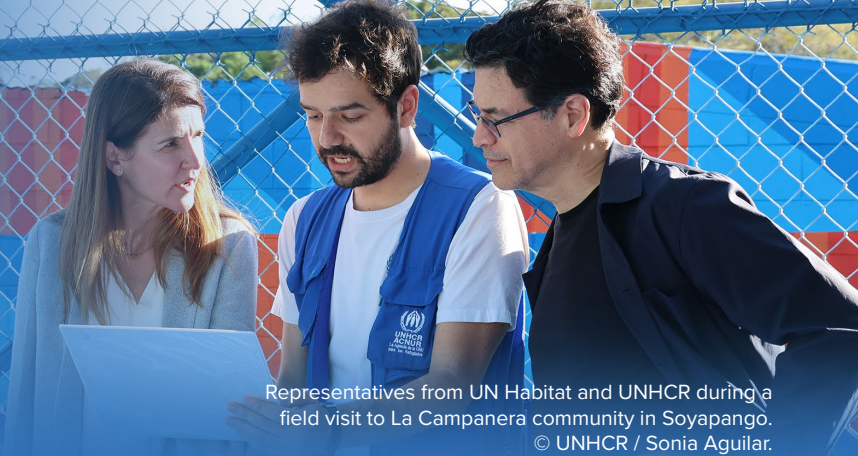
Representatives from UN Habitat and UNHCR during a field visit to La Campanera community in Soyapango.

UNHCR, the UN Refugee Agency in El Salvador, and UN-Habitat, the United Nations Human Settlements Programme, launched “My Community, My Home,” an initiative that will contribute to the comprehensive transformation of precarious settlements in El Salvador.