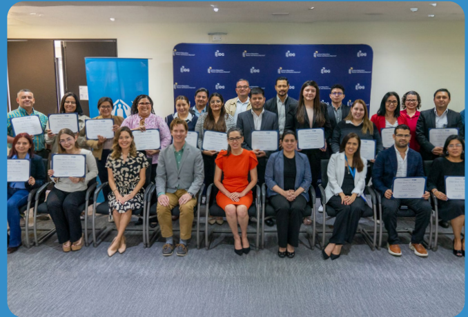
Representatives from institutions and organizations during the closing event of a UNHCR-supported diploma on international protection.

The initiative is part of “Revive tu Espacio”, a broader effort by UNHCR to revamp public areas in communities affected by historical violence and displacement.