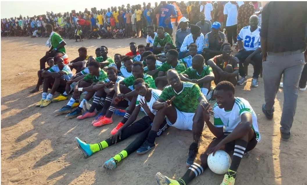
Youth peacebuilders from Khor Al-Waral and Al-Jameya refugee camps and Al-Debaiba and Asola host communities, organized a friendly football tournament strengthening relationships.

In Sudan, violence against women and girls is under-reported because survivors do not access services due to fear of stigma, retaliation, and insecurity. This also affects their ability to receive timely support. The most common types of violence reported in the case management system were physical assault, intimate partner violence, early marriage and psychological abuse. During the year, UNHCR and its partners strengthened life-saving, survivor-centred response services addressing health, psychosocial support, legal assistance and made referrals to service providers.