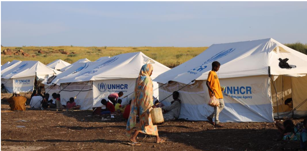
Following waves of violence in Sennar and Al Jazirah States, over a million people fled to the eastern states of Gedaref and Kassala where UNHCR and partners mobilized to provide emergency shelters.

During the year, 23,736 displaced people received livelihood support to engage in agricultural production, start-up businesses and join village savings and loan groups enabling financial and economic inclusion. Women reported increased self-confidence and empowerment. Some USD 5.4 million in multi-purpose cash reached to close to 105,500 people , a 31% increase from 2023 enhancing financial autonomy and enabling them to meet essential needs. Another 45,000 people benefitted from sector-specific cash assistance.