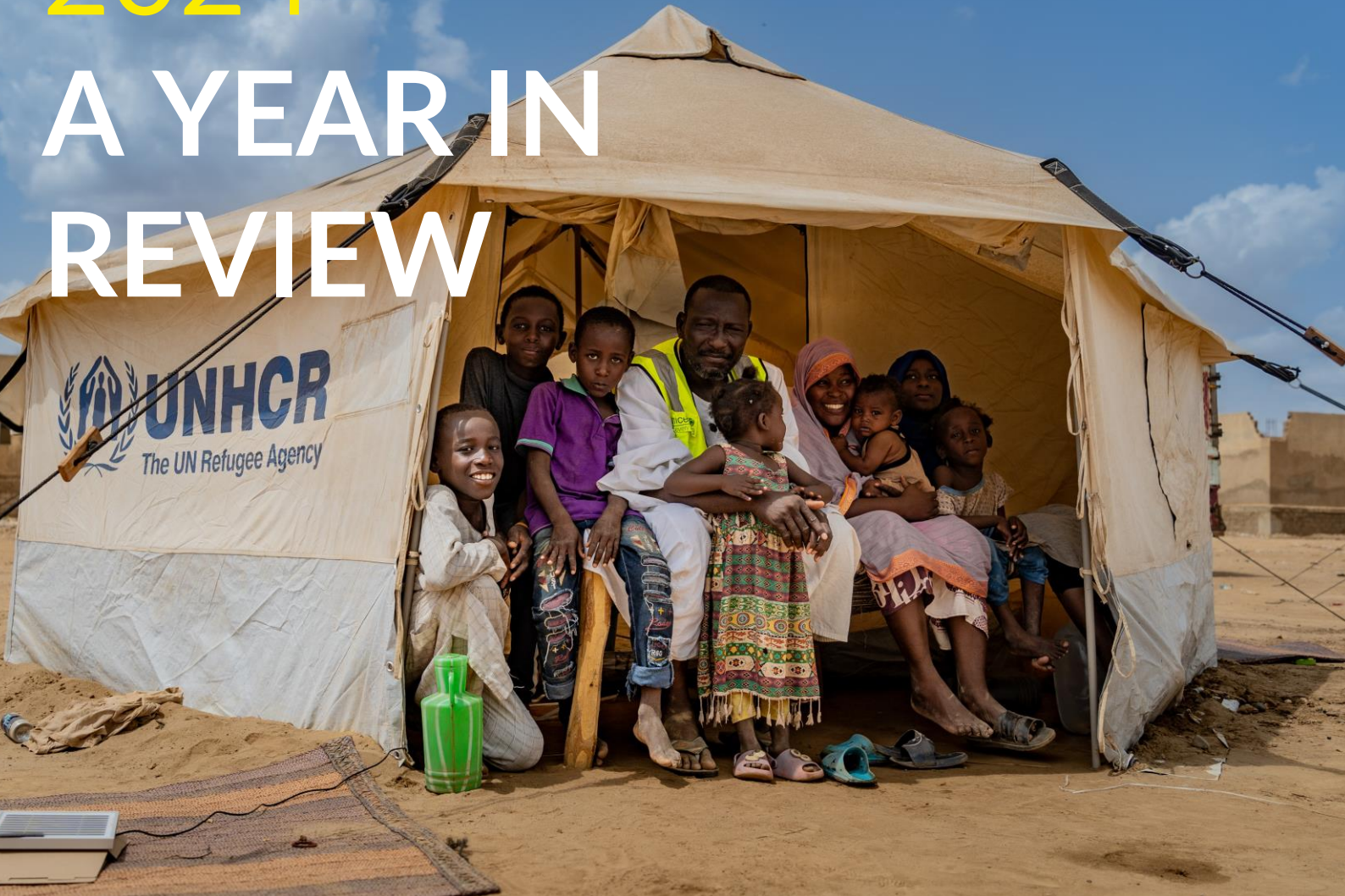
A Sudanese displaced family sits at the entrance of their tent at an IDP gathering site in Kassala State, eastern Sudan.