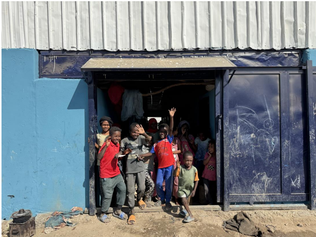
Refugees and asylum-seekers arriving in Kassala State are temporarily accommodated at the Shagarab Reception Centre awaiting refugee status determination procedures.

60,419 refugee children and young adults benefitted from education support and scholarships