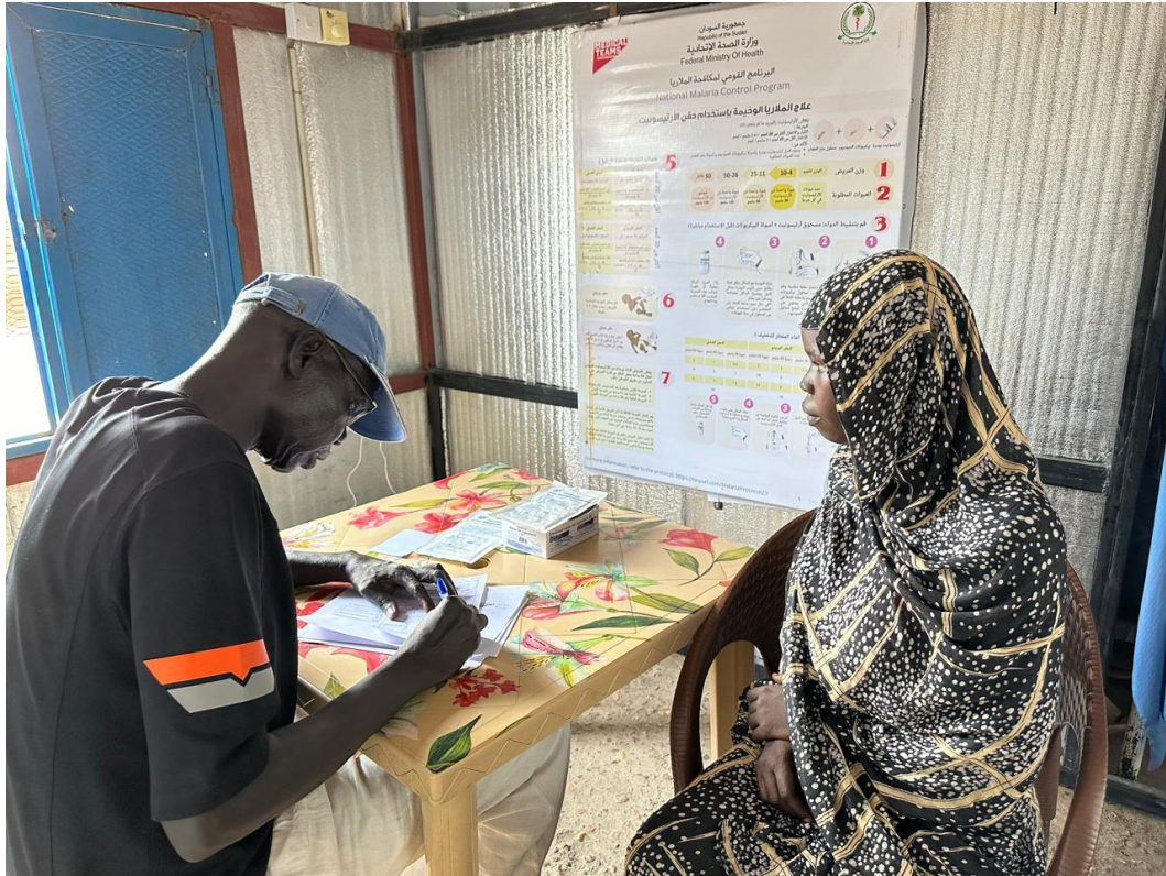
A South Sudanese refugee receives medical attention at the Al Redis 2 refugee camp clinic supported by UNHCR in White Nile State.