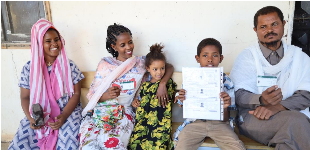
An Ethiopian refugee family completes registration in Village 8 in Al Fashaga, Gedaref State and shows their identity document.

The year started with renewed clashes in White Nile, Darfur, Kordofan and Khartoum States. In late January, the Adre border crossing – one of two entry points from Chad for inter-agency cross-border operations – was closed for the movement of humanitarian assistance, supplies and personnel. This closure prevented the humanitarian community from scaling up assistance and addressing the critical and growing needs of people in the Darfur and Kordofan States. In February, there was a nation-wide communications blackout lasting about six weeks, making communication with conflict-affected communities, forcibly displaced people, partners and staff challenging.