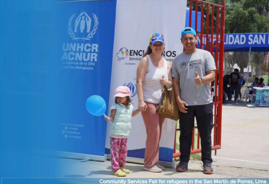
Community Services Fair for refugees in the San Martín de Porres, Lima