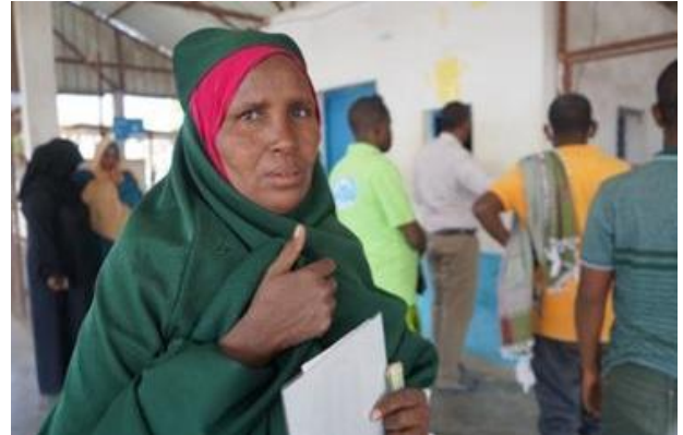
Refugee woman with her legal documents

UN Agencies in Djibouti published their annual report. On 28 April, UN agencies in Djibouti presented their annual report to the minister of foreign affairs and other partners. The report highlights efforts and progress made towards sustainable development goals and the journey to the 2030 Agenda. The report contains the achievements from different agencies including success stories from refugees. Commendable efforts were made in the fight against genital mutilation, and other areas such as education, creation of employment for the youth as well as health and nutrition. The government also commended excellent relations between the UN and the government.