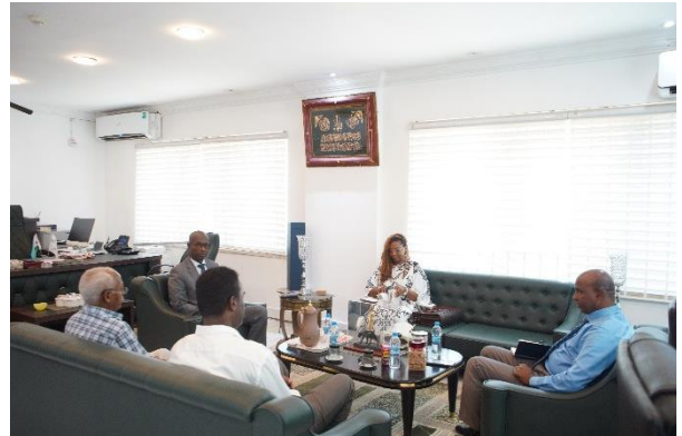
UNHCR Representative met with the Minister of Interior