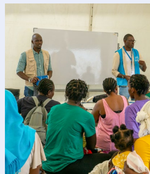
Las Palmas, Canary Islands – UNHCR staff provide information about asylum to individuals recently arriving in the Canary Islands at a center for women and children in Las Palmas.

Critically, the current funding landscape is limiting UNHCR's ability to maintain consistent field presence at disembarkation sites and reception facilities. The scaling down of personnel and resources at arrival points—particularly on frontline islands—will negatively impact timely identification of vulnerable individuals including unaccompanied children, survivors of trafficking and those with specific needs. The funding crisis will also limit the provision of accurate, life-saving information on international protection, legal pathways and available services. Unless critical funding is secured, gaps in referral mechanisms and access to protection will impact the most vulnerable, thereby increasing the risk of rights violations and hinder early engagement necessary for ensuring effective asylum procedures. Sustained, predictable funding remains crucial for UNHCR to fulfil its protection mandate and support national systems in responding effectively and humanely to those arriving by sea.