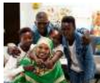
Refugees at the ETC in Timișoara

In Timișoara, refugees hosted at the Emergency Transit Centre (ETC) took part in an arts and crafts workshop, performed traditional dances and songs while participating to other recreational activities. UNHCR held an event with IKEA Foundation to inform staff about UNHCR's mandate and activities. In Arad, UNHCR together with refugee-led organisation Centru de Vis, the local Directorate for Social Assistance and civil society organisations held a musical event for Ukrainian refugee children and children from the host community with the message: "when we open our hearts, new bonds grow stronger".