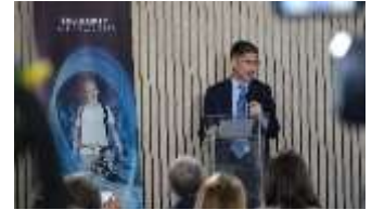
Reinauguration of UNHCR's Community Centre in Bucharest

Last week, UNHCR and partners marked the World Refugee Day (20 June) with a series of events with the participation of local and national authorities and institutions, media, humanitarian actors, together with refugees hosted in Romania. The interim Prime Minister of Romania expressed support for refugees in a statement . The UNHCR Representative led the re-inauguration of UNHCR's RomExpo Community Centre, during which he underlined that solidarity with refugees is about listening to their voices and the voices of hosting communities and building an inclusive community together. Messages of support were delivered by the Ambassadors of Canada, Sweden and Türkiye, as well as by the State Secretary and Head of the Department for Emergency Situations (DSU), the General Inspectorate for Immigration (GII), the General Directorate of Social Assistance of the Municipality of Bucharest, as well as refugees from Ukraine and Syria and the NGO Green Revolution (see below).