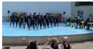
World Refugee Day event in Constanța

In Constanța, UNHCR hosted a vibrant World Refugee Day event with some 200 participants, including refugees, members of the host community, local officials, and representatives of civil society at the Summer Theatre of the Children's Palace. The programme featured performances by participants from Ukraine, Romania, Greece, and Syria, celebrating cultural diversity and resilience, and a variety of interactive activities for all ages.