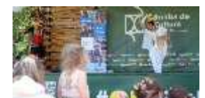
"Together in the Park"

On 21 June, partners of the Refugee Response Plan expressed solidarity with refugees worldwide at the first of a series of special events celebrating social cohesion, multiculturalism, and the power of community. taking place in Bucharest over the summer under the label "Together in the Park" in coordination with NGO Green Revolution.