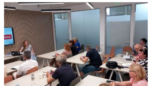
On 11 June, Ukrainian refugees attend an information session on accessing support for persons with disabilities at UNHCR's RomExpo Community Centre in Bucharest.

On 11 June, UNHCR held an information session on accessing support for Ukrainian refugees with disabilities at UNHCR's RomExpo Community Centre in Bucharest. Participants shared personal experiences and exchanging practical tips on navigating procedures and accessing support. Many highlighted challenges, such as the requirement to frequently re-apply and high associated costs. Participants highlighted the need for longer certification validity and more affordable procedures. The session supported access to social assistance and enhanced peer network information exchange. So far in 2025, UNHCR has provided protection counselling services and legal support to 5,819 refugees.