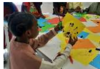
A refugee child at the ETC in Timișoara prepares to mark World Refugee Day.

During the past week, refugees hosted at the Emergency Transit Centre (ETC) in Timișoara took part in a creative workshop in preparation for World Refugee Day on 20 June. The event brought together 15 refugee adults and children from Afghanistan and Sudan refugees to create a symbol of strength and hope in the form of a group art piece making handprints on large canvas as a statement of solidarity. The theme of this year’s World Refugee Day is “Solidarity with Refugees”. So far in 2025, the ETC provided assistance to some 200 refugees and helped more than 4,350 refugees since opening in 2008.