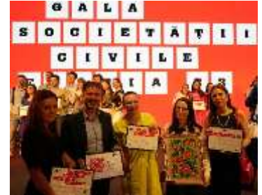
On 24 June, UNHCR took part in the 23 rd edition of the Civil Society Gala – Romania's annual event celebrating civic engagement.

UNHCR is grateful to the donors for unearmarked and softly earmarked contributions to the Ukraine situation. UNHCR in Romania is also grateful to donors contributing to 2025 programmes. For more details: Romania Funding Update – 2025