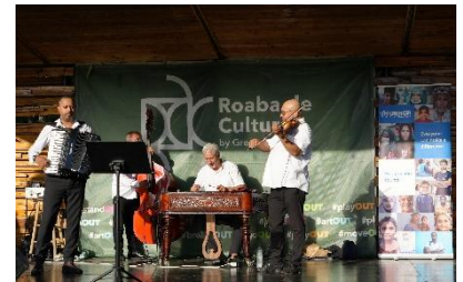
On 27 July, UNHCR in collaboration with NGO Green Revolution (Roaba de Cultură) and RRP partners, hosted “Together in the Park: Music Without Borders”.

On 27 July, UNHCR in collaboration with NGO Green Revolution (Roaba de Cultură) and partners of the Refugee Response Plan (RRP), hosted “Together in the Park: Music Without Borders” - a celebration of multiculturalism, community, and culture. The open-air event - with live music and workshops for children - was the second in a series of community activities aimed at fostering social cohesion, multicultural understanding, and solidarity, bringing together refugees, migrants, and the host community in Bucharest. The third in the series of “Together in the Park” events supported by UNHCR will take place on 30 August.