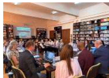
On 5 July, UNHCR took part in the 13 th Summer School on Refugee Protection and Rights, hosted by “Dunărea de Jos” University in Galați.