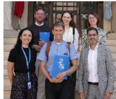
On 3 July, UNHCR met with the Anglican Communion’s Representative to the UN in Geneva.

UNHCR is grateful to the donors for unearmarked and softly earmarked contributions to the Ukraine situation. UNHCR in Romania is also grateful to donors contributing to 2025 programmes. For more details: Romania Funding Update – 2025