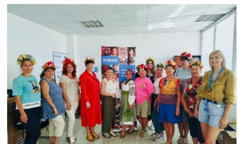
Ukrainian refugee women participated in the UNHCR-supported Women’s Club and Community Mobilizers “Together We Reflect” event in Constanța.

UNHCR supports refugees from Ukraine directly through its activities in the field. On 7 August, 14 Ukrainian refugee women participated in the “Together We Reflect” event at the UNHCR-hosted Women’s Club in Constanța. The women shared stories about their journeys and experiences as refugees in Romania. The event included a singing session and a creative flower wreath-making workshop. The group also reflected on key concerns around Sexual Exploitation and Abuse (SEA). The initiative aimed to empower women by promoting social exchange, self-expression, and respect for their own and others’ rights in a safe and supportive environment.