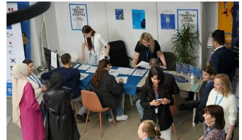
Refugees receive support at UNHCR’s Community Centre in Bucharest.

UNHCR’s Community Centre at RomExpo in Bucharest continues to deliver essential services to around 250 refugees from Ukraine every day. The centre serves as a free of charge one-stop-shop for key services and for the identification of vulnerable individuals who require referrals to services located outside the Community Centre. 11 National and international actors provide a range of services to refugees at the centre, including registration for temporary protection, legal assistance as well as livelihoods counselling. In mid-2025, following a three-month transformation project at the Community Centre, UNHCR opened specially designed spaces to host partners, refugee-led organizations, community-based organizations, and other groups from the refugee community in need of free and functional spaces for meetings and events.