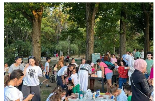
On 30 August, UNHCR together with NGO Green Revolution (Roaba de Cultură) held the third edition of “Together in the Park”.

On 30 August, UNHCR in collaboration with the NGO Green Revolution (Roaba de Cultură) and 8 partners of the Refugee Response Plan (RRP), held the third edition of “Together in the Park” in Herastreau Park celebrating social cohesion, multiculturalism, and the power of community. The open-air event on the theme “Art without Borders – bringing communities together through arts and culture”, featured cultural and arts workshops for children and youth and photo exhibitions. The event successfully brought refugees, migrants, and the host community together in a playful manner forging bridges between the communities in Bucharest.