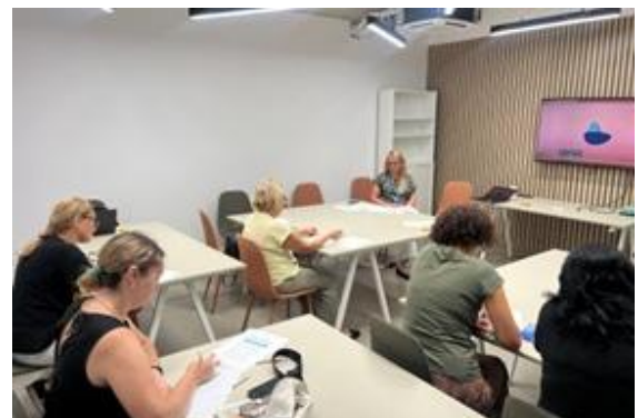
On 12 September, refugee women attend an awareness session well-being at UNHCR's RomExpo community centre.