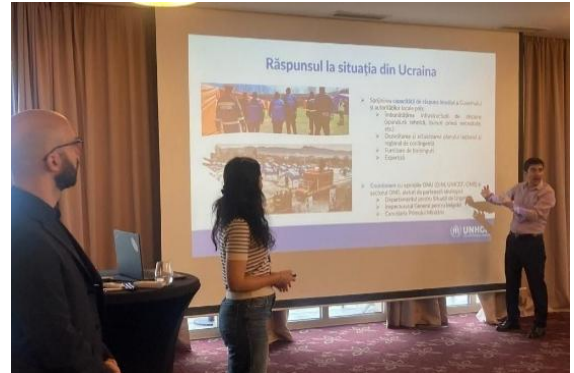
On 12 September, UNHCR participated in a local coordination workshop hosted by the Department for Emergency Situations (DSU) with the support of IOM in Braşov.

UNHCR is grateful to the donors for unearmarked and softly earmarked contributions to the Ukraine situation. UNHCR in Romania is also grateful to donors contributing to 2025 programmes. For more details: Romania Funding Update – 2025