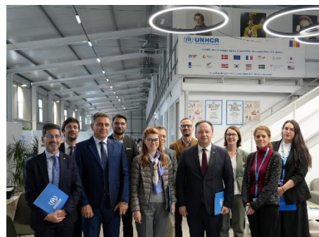
The Deputy Minister for Social Policies, Family and Unity of Ukraine, and the Ambassador of Ukraine were welcomed by the General Inspector for Immigration (emp), the Chief of Cabinet of the State Secretary for Emergencies and the UNHCR Representative.