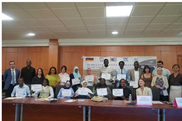
DAFI Seminar 2025: Certificate award ceremony for the DAFI scholarship laureates.