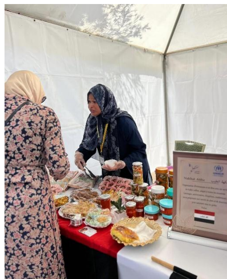
Refugee project holders took part in the culinary festival organized by the Diplomatic Circle in Morocco, showcasing their culture through cuisine.