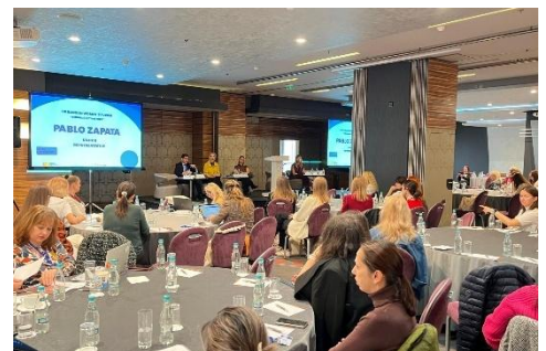
On 23 October, UNHCR supported the three-day Ukrainian Women’s Forum “Rebuilding Together” bringing together 100 refugee women.