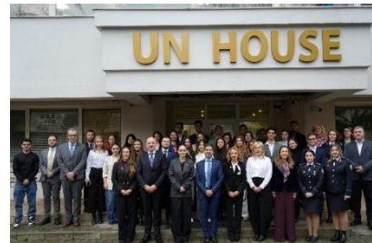
On 8 December, students attend the opening of the 2025 edition of the “Nicolae Titulescu” Humanitarian Law and Refugee Law Competition.