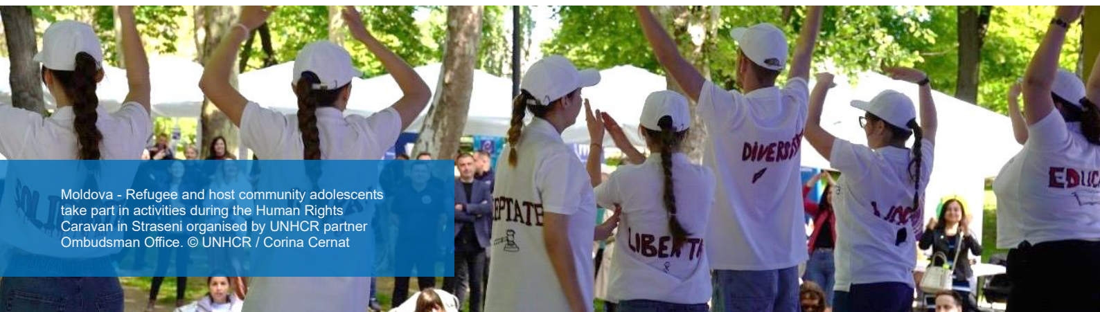
Moldova - Refugee and host community adolescents take part in activities during the Human Rights Caravan in Straseneni organised by UNHCR partner Ombudsman Office.

Preparedness and contingency planning will be reinforced, in coordination with the Government of Moldova, to ensure readiness to respond to potential future population movements and sudden increases in protection needs.