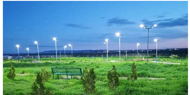
Solar lights installed in Newroz camp, improving living conditions for residents.