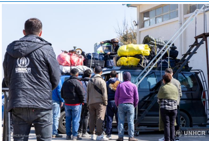
UNHCR and its partners provide assistance at the Joussieh border crossing in Homs to thousands of people fleeing hostilities in Lebanon.