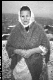
UNHCR / B. MARALLO