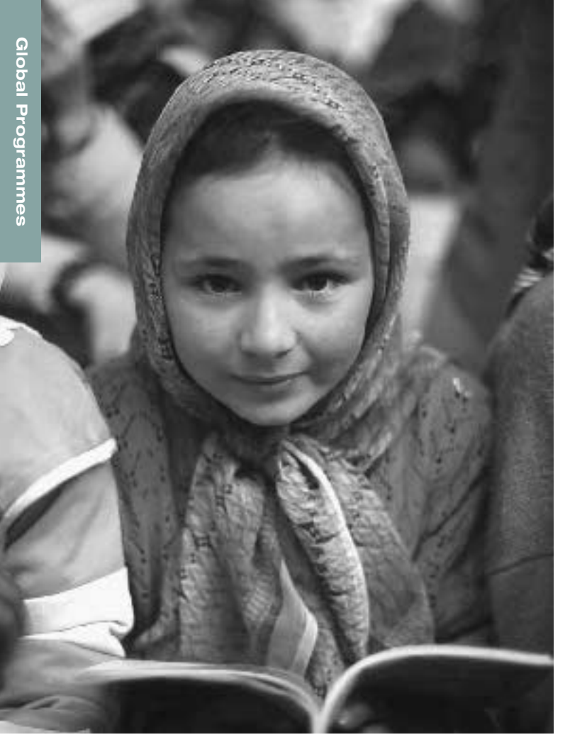
Education is a policy priority – Girls who fled Afghanistan received schooling in neighbouring countries.

these obstacles in five pilot countries: Eritrea, Ethiopia, Kenya, Uganda, and Northwest Somalia. The experience and results of these assessments would be used as a tool to develop future programmes and would also be used to monitor sexual violence and exploitation. Moreover, UNHCR participated in the UN Girls' Education Initiative.