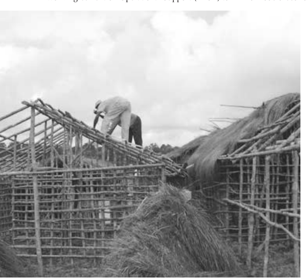
Sierra Leone: Destroyed villages had to be reconstructed from scratch. Returnees busy rebuilding their homes.

term development by forging stronger and more predictable partnerships with development actors. These partnerships, underpinned by field initiatives, would enable UNHCR to take up its role in assisting refugees in their search for durable solutions.