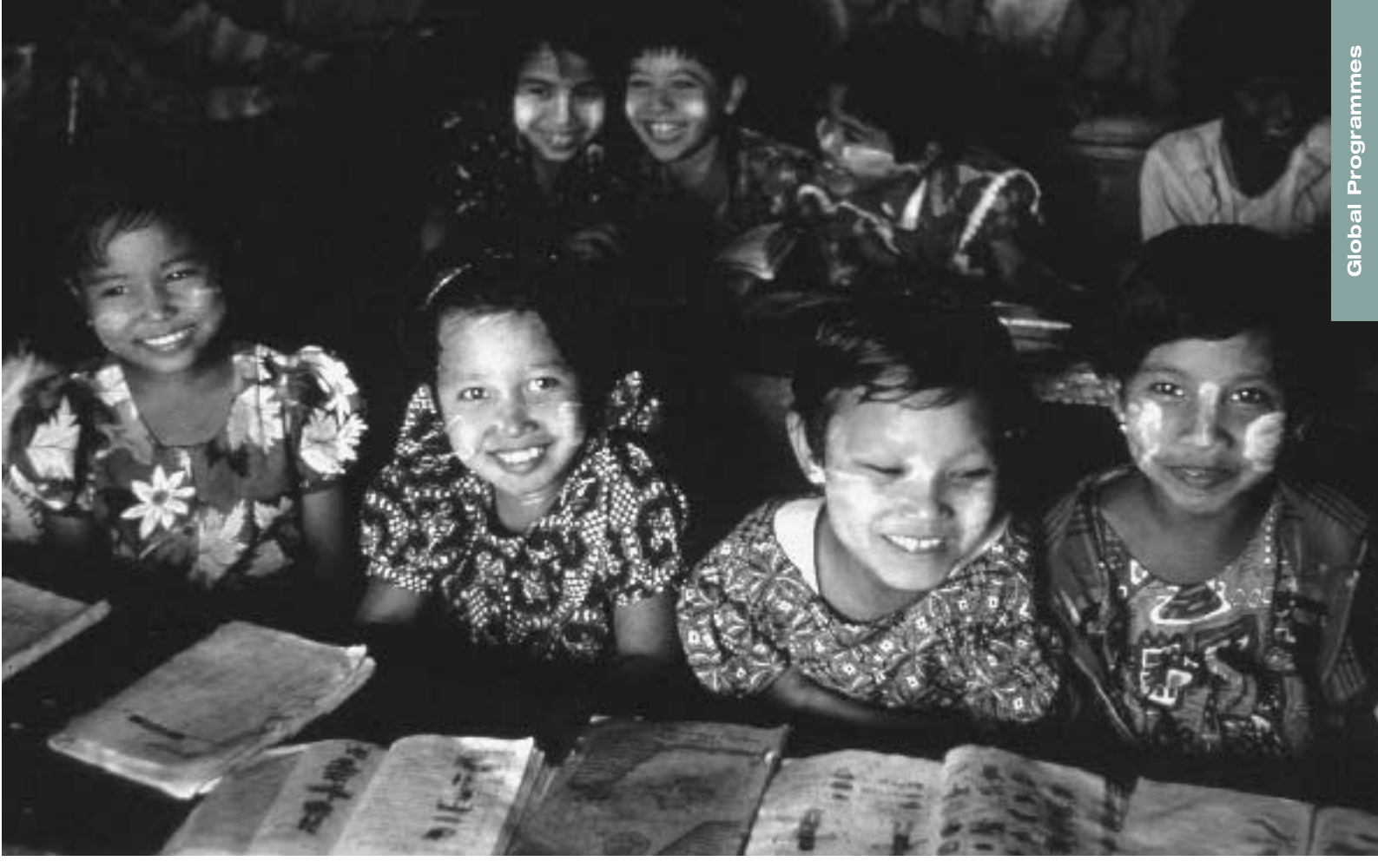
Myanmar: Particular emphasis is placed on having girl children attend school. Returnee girls at a UNHCR-funded primary school.