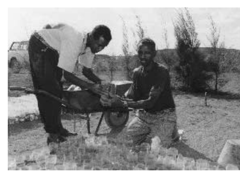
Ethiopia: Measures are taken to rehabilitate environmentally degraded areas around refugee settlements. Somali refugees working in a tree nursery.

remained the same as that set out in UNHCR's Environmental Policy (1996), namely to ensure that the environmental impact of refugees and returnees be kept to a minimum through the application of the key principles of prevention, cost-effectiveness, and a participatory approach involving the local population and the refugees. It has to be recognised, however, that much still remains to be done in relation to the preventive dimension of this policy: refugees continue to collect firewood for cooking purposes, fell young trees for the construction of basic shelters, or remove ground cover to cultivate land. To the extent that these practices continue to exist, there will inevitably be frictions with host communities and governments, and the risk of undermining the institution of asylum.