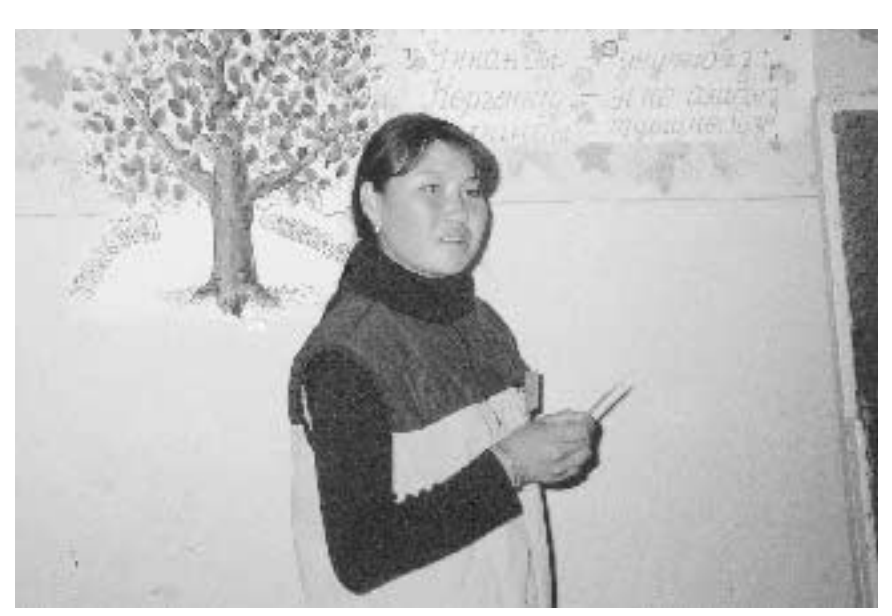
Kyrgystan: Public awareness campaign against ravages of HIV/AIDS.

• Kenya: A regional mechanism was established in Nairobi to provide technical support to HIV/AIDS programmes in refugee communities in the East and Horn of Africa;